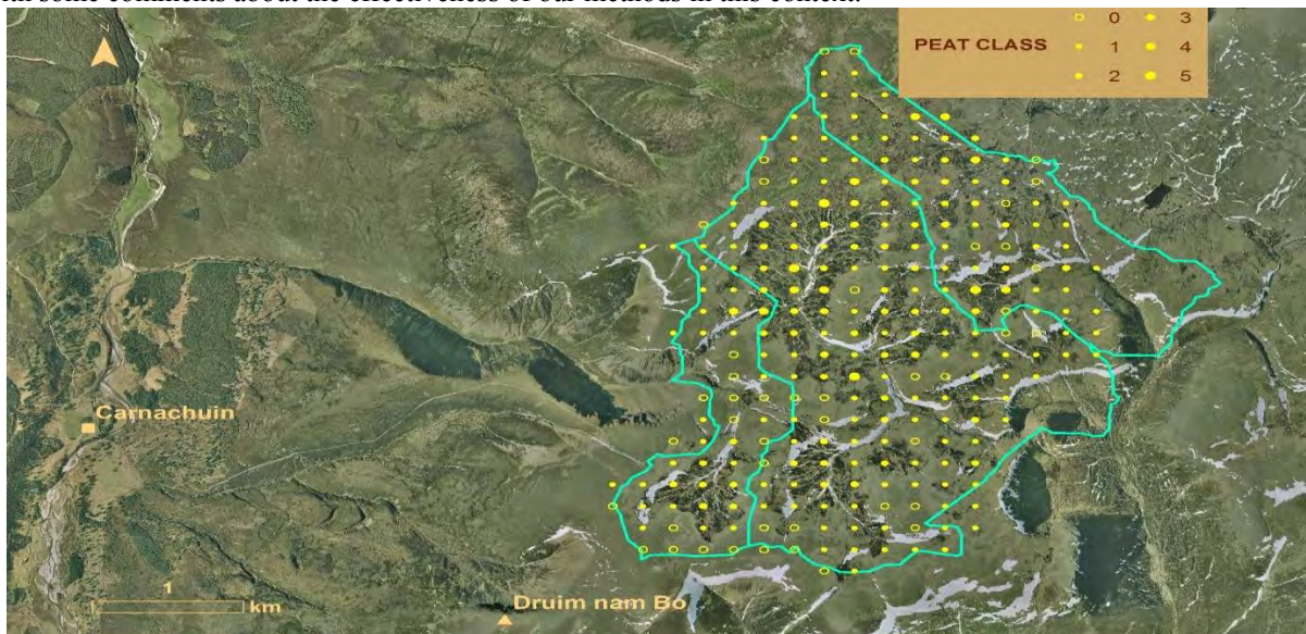
Figure 1. Aerial view of the Mòine Mhór plateau and River Feshie (flowing south–north at left side of image). Cyan polygons divide the plateau between three stream catchments, namely (from west to east) Allt Garbhlach, Coachan Dubh and Allt Sgairnich. Locations of survey quadrats are indicated by yellow points whose sizes reflect peat thickness (key to classes: 0 = no peat, 1 = 1–30 cm, 2 = 31–60 cm, 3 = 61–90 cm, 4 = 91–120 cm, 5 = 121–150 cm). The locations of Carnachuin and Druim nam Bo are also shown. Catchment boundaries derived from OS Terrain 5 DTM [ASC geospatial data], Scale 1:10000, Tiles: nn89ne, nn89se, nn99sw, nn99nw, Updated: 24 March 2015, Ordnance Survey (GB), Using: EDINA Digimap Ordnance Survey Service, < http://digimap.edina.ac.uk >, Downloaded: 2015-08-04 21:44:16.33.

making efficient use of fieldwork time a priority and remote observation techniques highly attractive. We conclude with some comments about the effectiveness of our methods in this context.