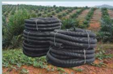
FLOLINE 3-W ® TRIPLE WALL PROFILED HDPE PIPE