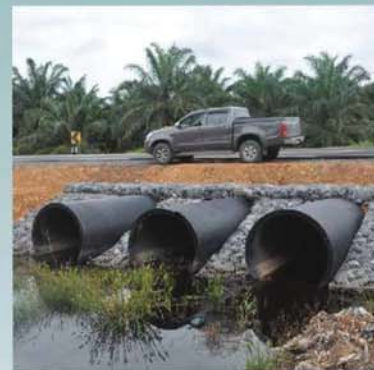
WEIDALINE ® SUBSOIL DRAINAGE PIPE