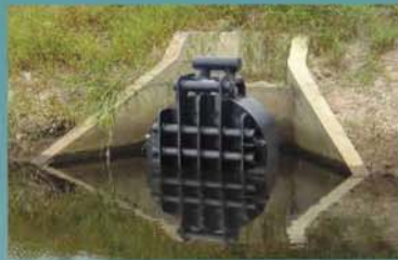
FLOLINE 3-W ® HDPE FLAPGATE