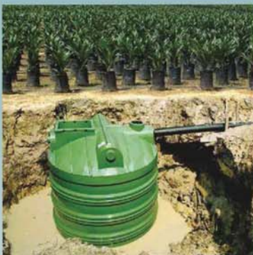
ECOSEPT ™ SEPTIC TANK