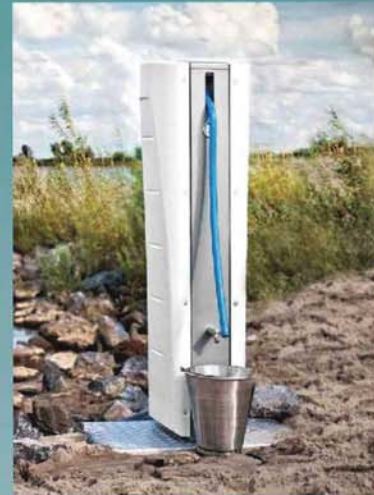
VP500 COMPACT WATER TREATMENT SYSTEM